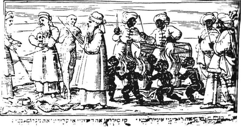
Fig. 7. Enchanters and Necromancers , woodcut from the Passover Haggadah , Venice, Giovanni De Gara, 1609.