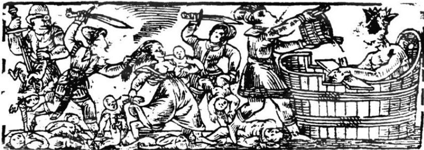
Fig. 2. The Pharaoh's Bath of Blood , woodcut from the Passover Haggadah, without publisher, circa 1580.

פרעם אין יידן קיכדר בלוט ער האט גיבארן : גאט און סולדיג בלוט ניט און גילאכן וויל לאן