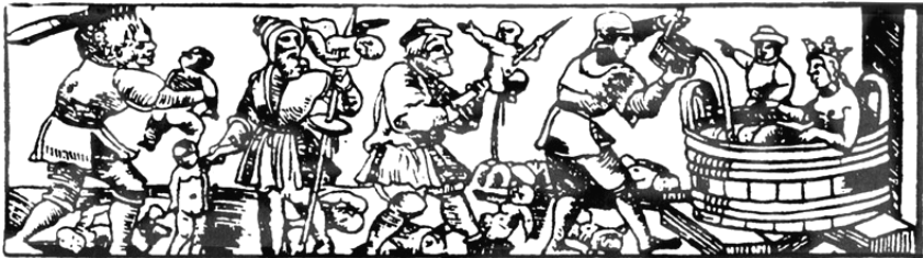
Fig. 1. The Pharaoh's Bath of Blood , woodcut from the Passover Haggadah, Prague, Gershom Cohen, 1526.

פרעם אין יידן קיכדר בלוט ער האט גיבארן : גאט און סולדיג בלוט ניט און גילאכן וויל לאן