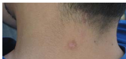
A burn mark visible on the neck of a 20-year-old former detainee

In some cases it is reported that cigarettes have been stubbed out on detainees' bodies. On at least one bus in which detainees had been held in the Homs area on 18 May, soldiers counted those arrested by stabbing a lit cigarette on the back of the detainees' necks. An Amnesty International delegate saw the