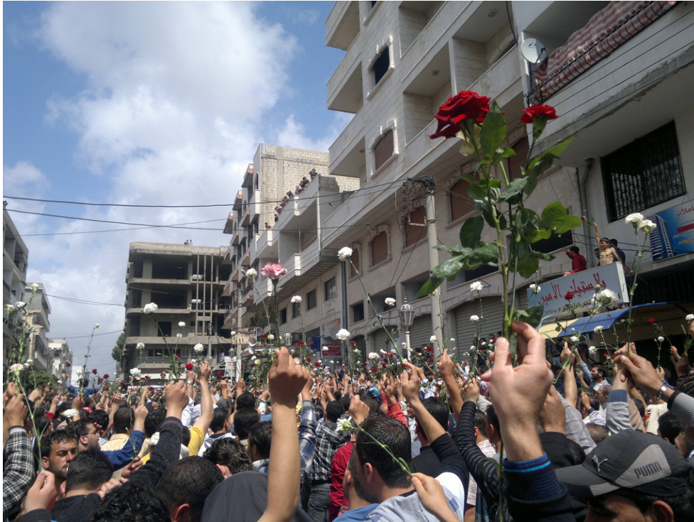
A peaceful pro-reform demonstration in Baniyas, a coastal town north of Damascus

Since the end of 2010, millions of people across the Middle East and North Africa region have taken to the streets to call for greater rights and freedom and the replacement of authoritarian regimes. In Syria, ruled with an iron hand by Hafez al-Assad from 1971 to 2000 and since then by his son Bashar al-Assad, small demonstrations were held in February but evolved into mass protests only in mid-March. Since then, the protests have spread nationwide on an unprecedented scale and with a momentum that shows no sign of abating despite severe government repression which has seen many hundreds of people killed.