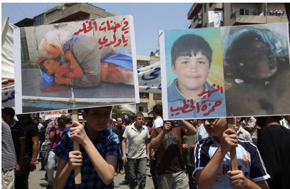
Protesters hold placards of Hamza Ali al-Khateeb during a demonstration to express solidarity with Syria's anti-government protesters, in Tripoli, northern Lebanon