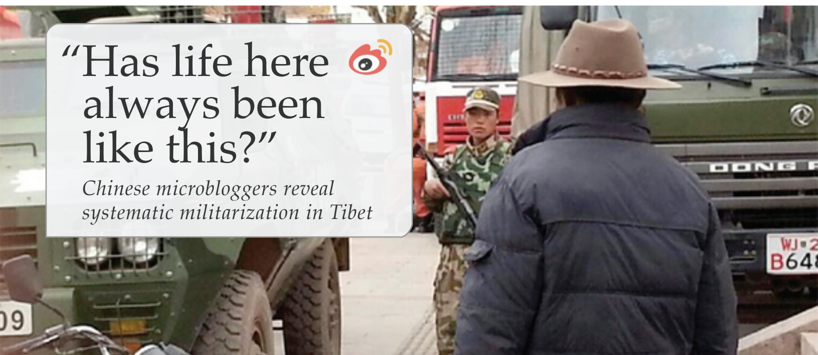
Photo posted by Chinese tourist on Weibo social media site, taken in the town square, Chamdo, Tibet Autonomous Region, in early spring, 2013.

Chinese microbloggers reveal systematic militarization in Tibet