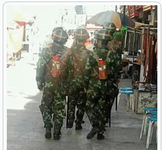
People's Armed Police carrying fire-extinguishers in Lhasa