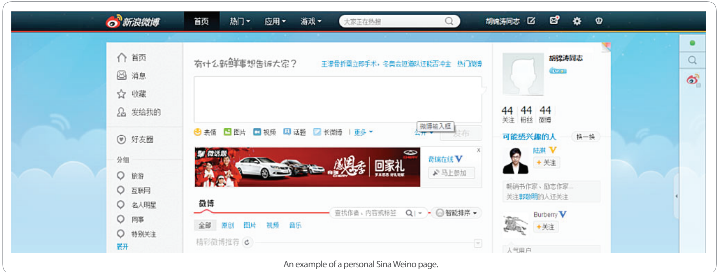
An example of a personal Sina Weibo page.

Sina Weibo (whose logo is above and used to identify sections in this report) is a Chinese microblogging website, similar to Twitter, owned by the Shanghai-based media conglomerate, Sina Corporation. While there are several Weibo services operating in China (the term “Weibo” translates into English as “microblog”), Sina Weibo is the most popular, making it nearly synonymous with the term “Weibo” itself.