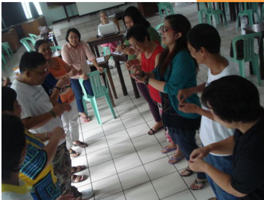
Photo: AKKAPKA Writeshop on Trainers' Manual for Gender-Sensitive ANV