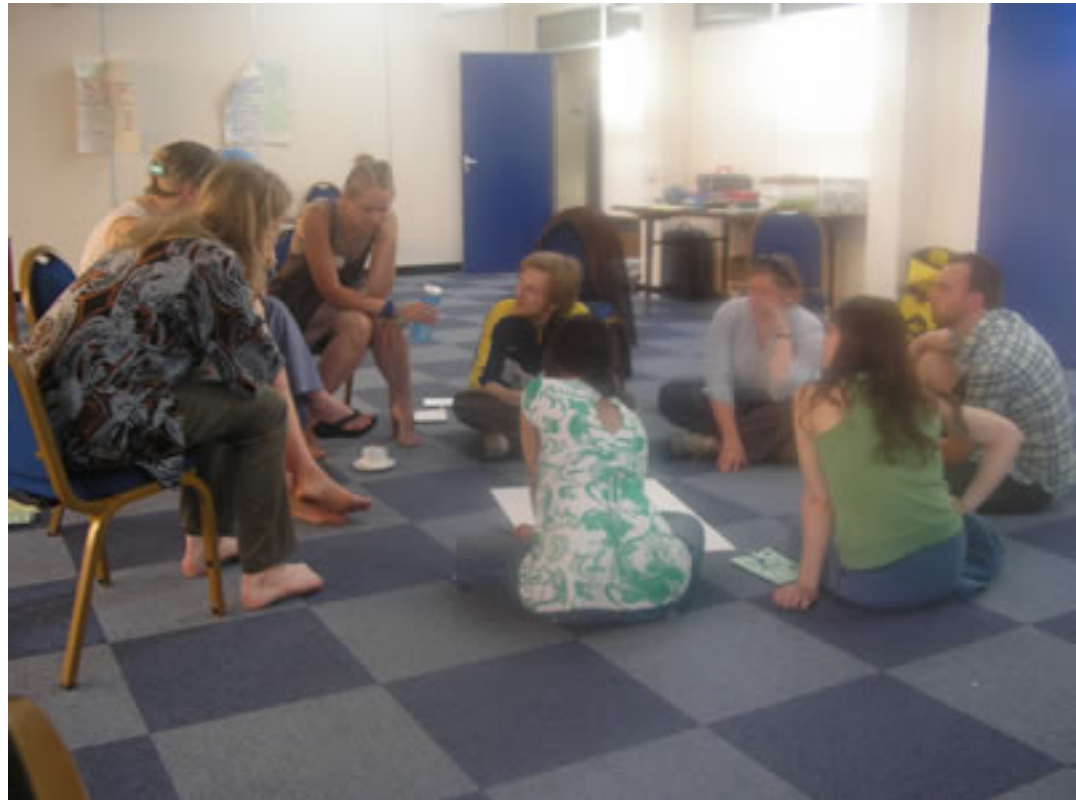
Peacemakers Network held a residential training weekend in London