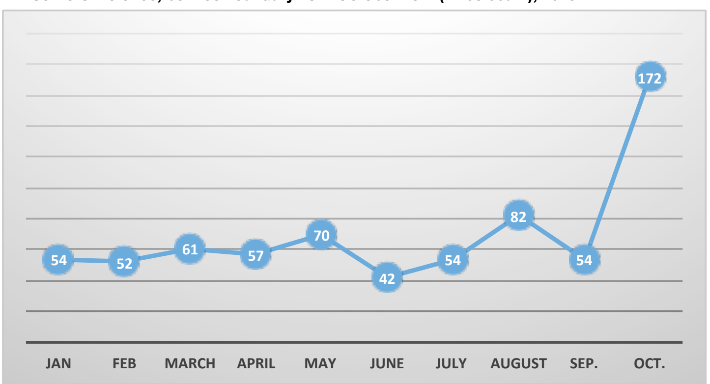
Chart 1 Settlers Violence, between January 1st - October 13th (till 08:00am), 2015