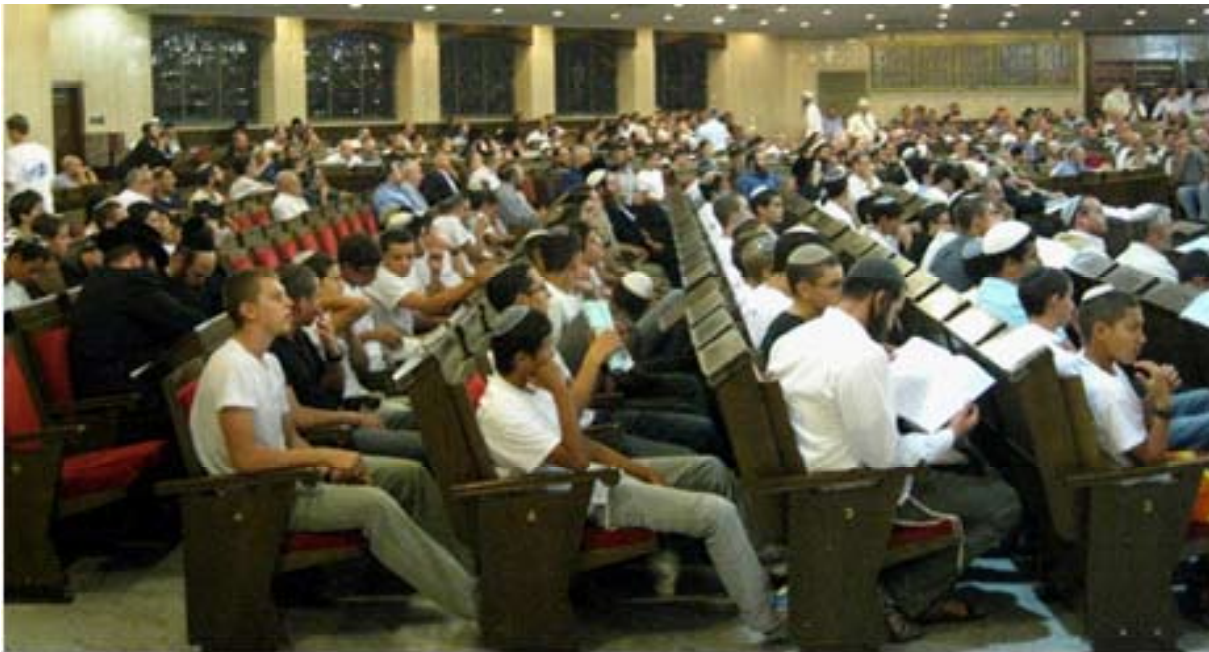
The audience at the 12th Temple conference at the Great Synagogue in Jerusalem.

The 12 th Temple Conference convened in September 2011 at the Great Synagogue in Jerusalem was held under the auspices of Makor Rishon , the daily newspaper identified with the national religious sector. 92 According to the Arutz Sheva website, the conference focused on "the conquest, Judaization and purification of the Temple Mount; removing the