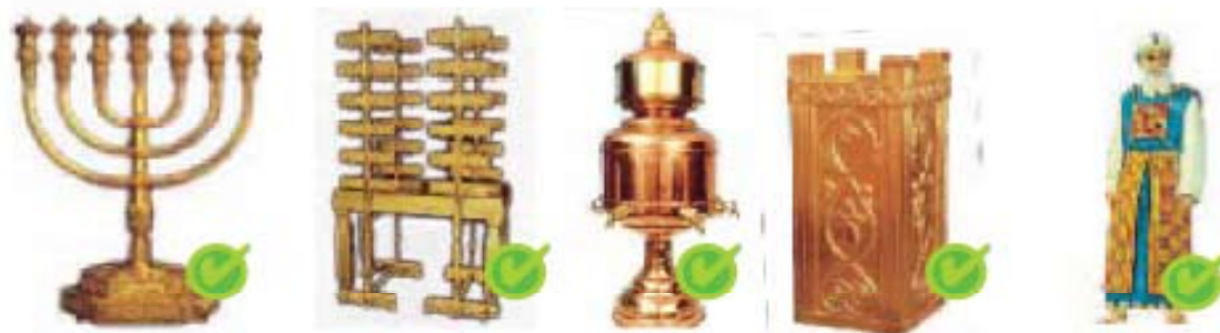
התמונות (והכלים) באדיבות מכון המקדש

From Daf Habayit, a weekly section on the Temple Mount in Makor Rishon , December 22, 2011: