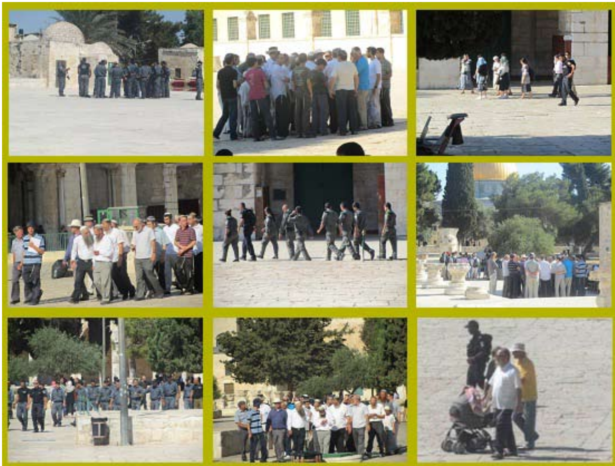
Pictures of groups of pilgrims, rabbis and soldiers in uniform, published on Arab websites

In recent years, the Islamic press has frequently reported on groups of uniformed Israeli soldiers entering as tourists and touring the Mount complex. Such acts are seen as an Israeli provocation and an attempt to change the arrangements in force on the Mount, according to which Israeli security forces are allowed to enter the complex only to protect order and security. On August 28, the Al-Aqsa Institute of Waqf and Heritage issued an official statement accusing Israel of violating the sanctity of the Al-Aqsa Mosque by allowing the very presence of non-Muslims at the site. According to the statement: