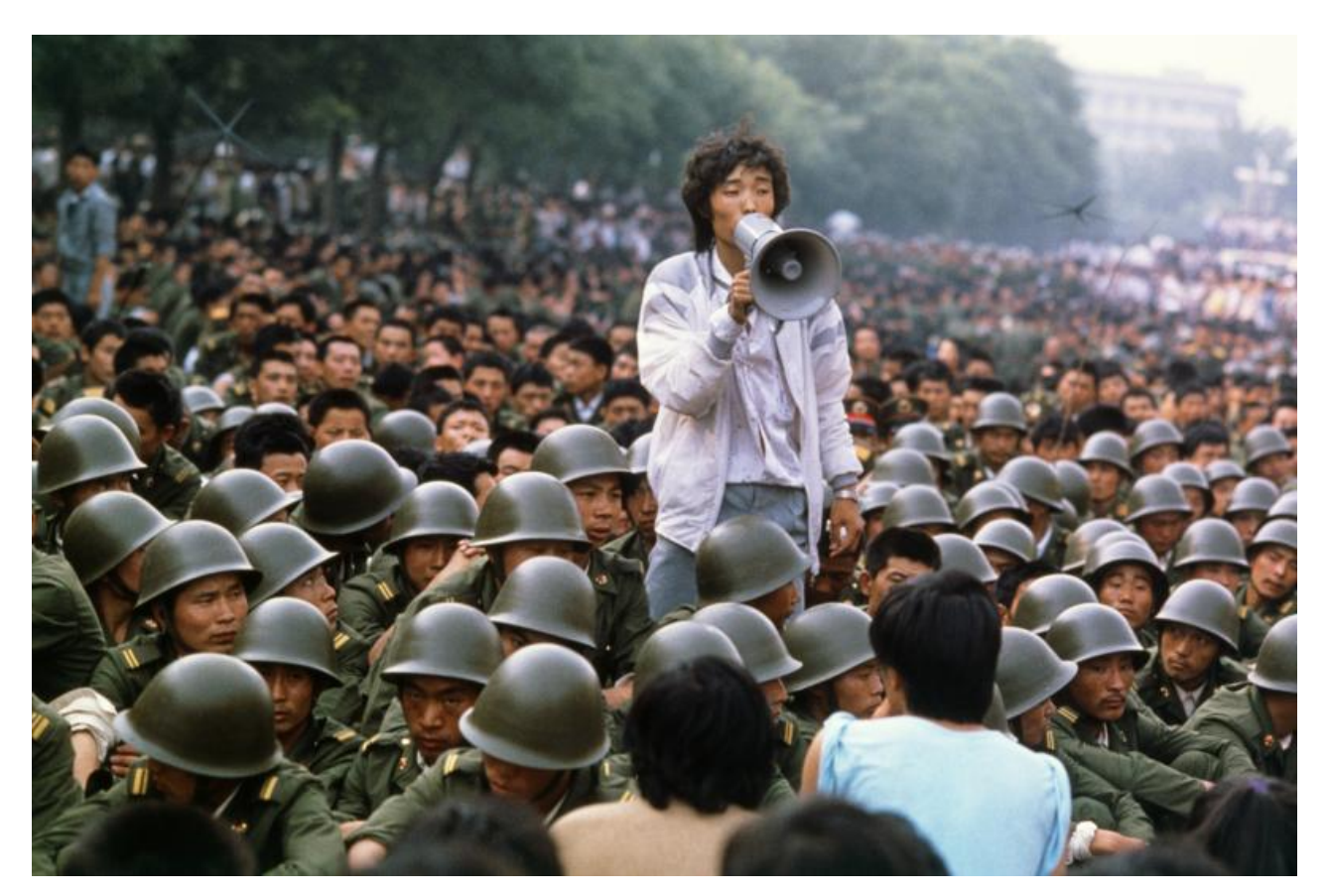
Last stand: protesting in Tiananmen Square, Beijing, June 1989

On April 15, 1989, the popular Chinese leader Hu Yaobang died of a heart attack in Beijing. Two years earlier, Hu had been cashiered from his post as general secretary of the <u>Chinese Communist Party</u> for being too liberal. Now, in the days after his death, thousands of students from Beijing campuses gathered in <u>Tiananmen Square</u>, in central Beijing, to demand that the party give him a proper sendoff. By honoring Hu, the students expressed their dissatisfaction with the corruption and inflation that had developed during the ten years of "reform and opening" under the country's senior leader, <u>Deng Xiaoping</u>, and their disappointment with the absence of political liberalization. Over the next seven weeks, the party leaders debated among themselves how to respond to the protests, and they issued mixed signals to the public. In the meantime, the number of demonstrators increased to perhaps as many as a million, including citizens from many walks of life. The students occupying the square declared a hunger strike, their demands grew more radical, and demonstrations spread to hundreds of other cities around the country. Deng decided to declare martial law, to take effect on May 20.