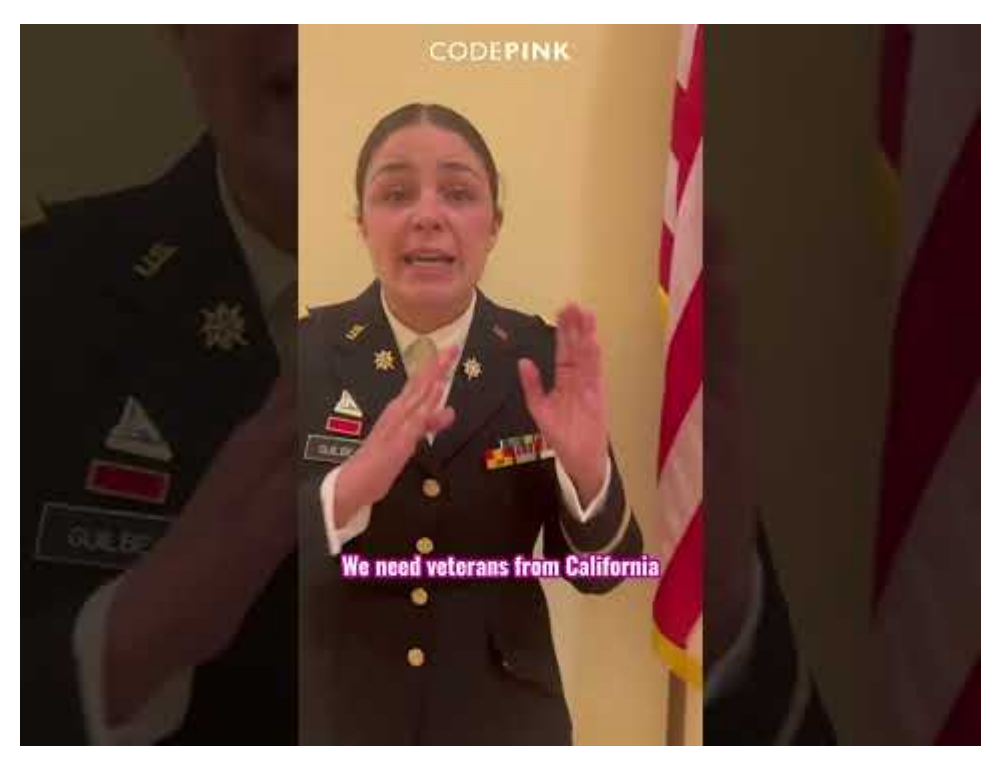
Watch Video At: https://youtu.be/thJ8sMj2q3M

"Israel is burning children alive, and Congress is complicit!" This morning, a 17-year veteran and intelligence officer disrupted the House Committee on Veterans' Affairs to call out the billions its members send to fund genocide while veterans are left behind.