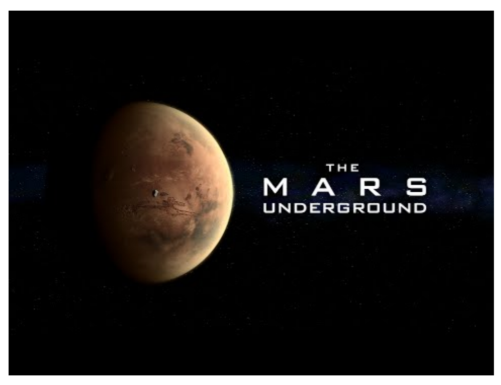
Watch Video At: https://youtu.be/tcTZvNLL0-w