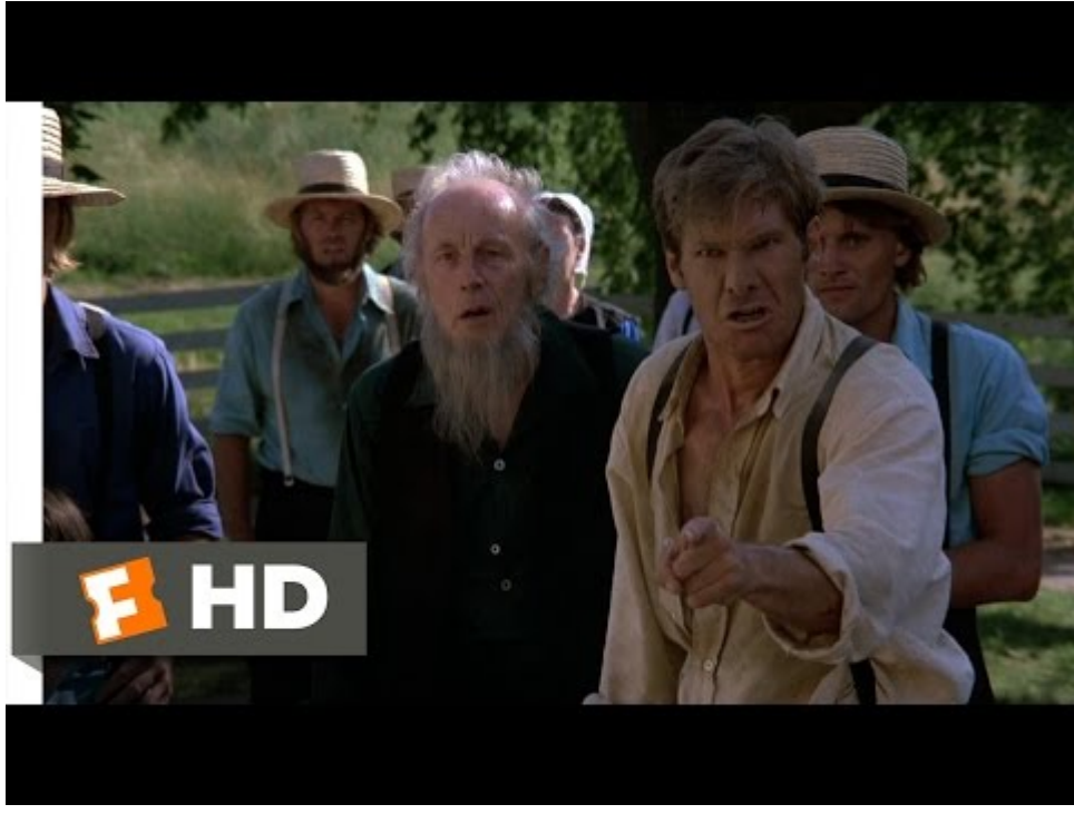
Watch Video At: https://youtu.be/hdW1BIDtcyU

What they fail to realize that military force and sheer schrecklichkeit make for a mighty powerful hammer, but like a hammer, they're not a universal tool. I hope that this latest outrage has pretty much exhausted its possibilities. Israel's reached a dead end. Inshallah, they've got nowhere left to go but down.