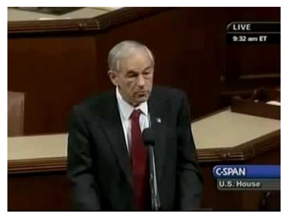
Watch Video At: https://youtu.be/cehzmAfC6w0